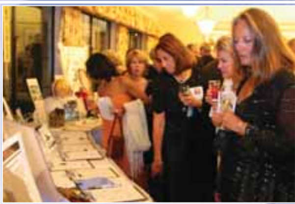
The auction table