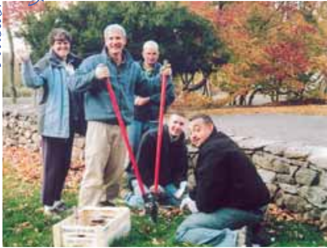
STAR's Garden Club plants "Blooms, Blooms, Blooms," an auction prize of 300 daffodils "sold" at the Galaxy 2004 Gala.