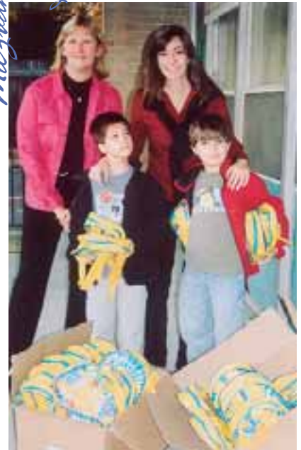
Families of the Conservative Synagogue of Westport assembled back to school backpacks for STAR families at their 4th Annual Mitzvah Day.